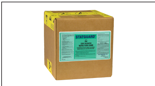
Figure 1. Statguard® Dissipative Neutral Floor Cleaner